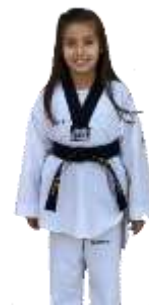
Black V-Neck Black Belts