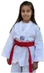
White V-Neck Color Belts