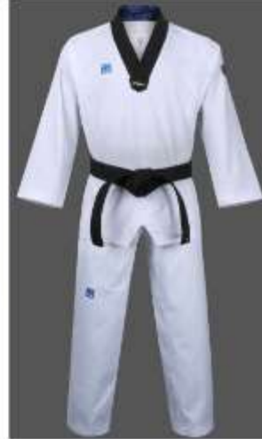
Black V-Neck Black Belts