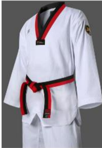
Poom V-Neck Black Belts U14