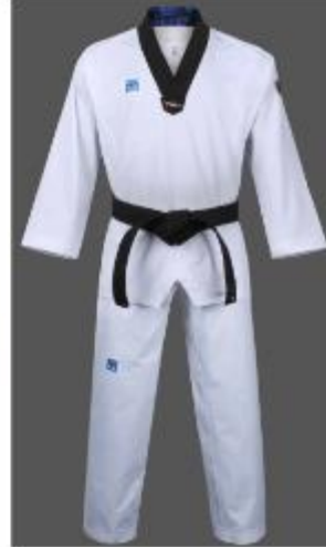
Black V-Neck Black Belts