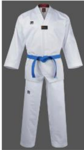
White V-Neck Color Belts