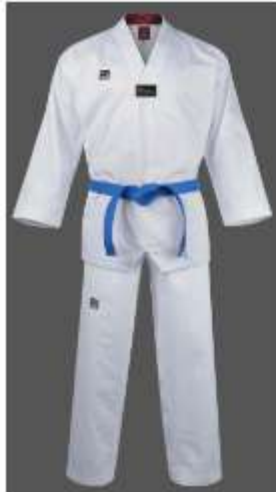
White V-Neck Color Belts