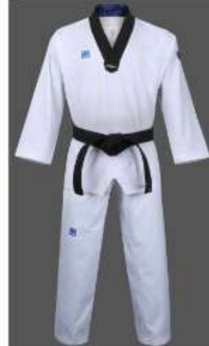
Black V-Neck Black Belts