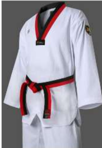
Poom V-Neck Black Belts U14